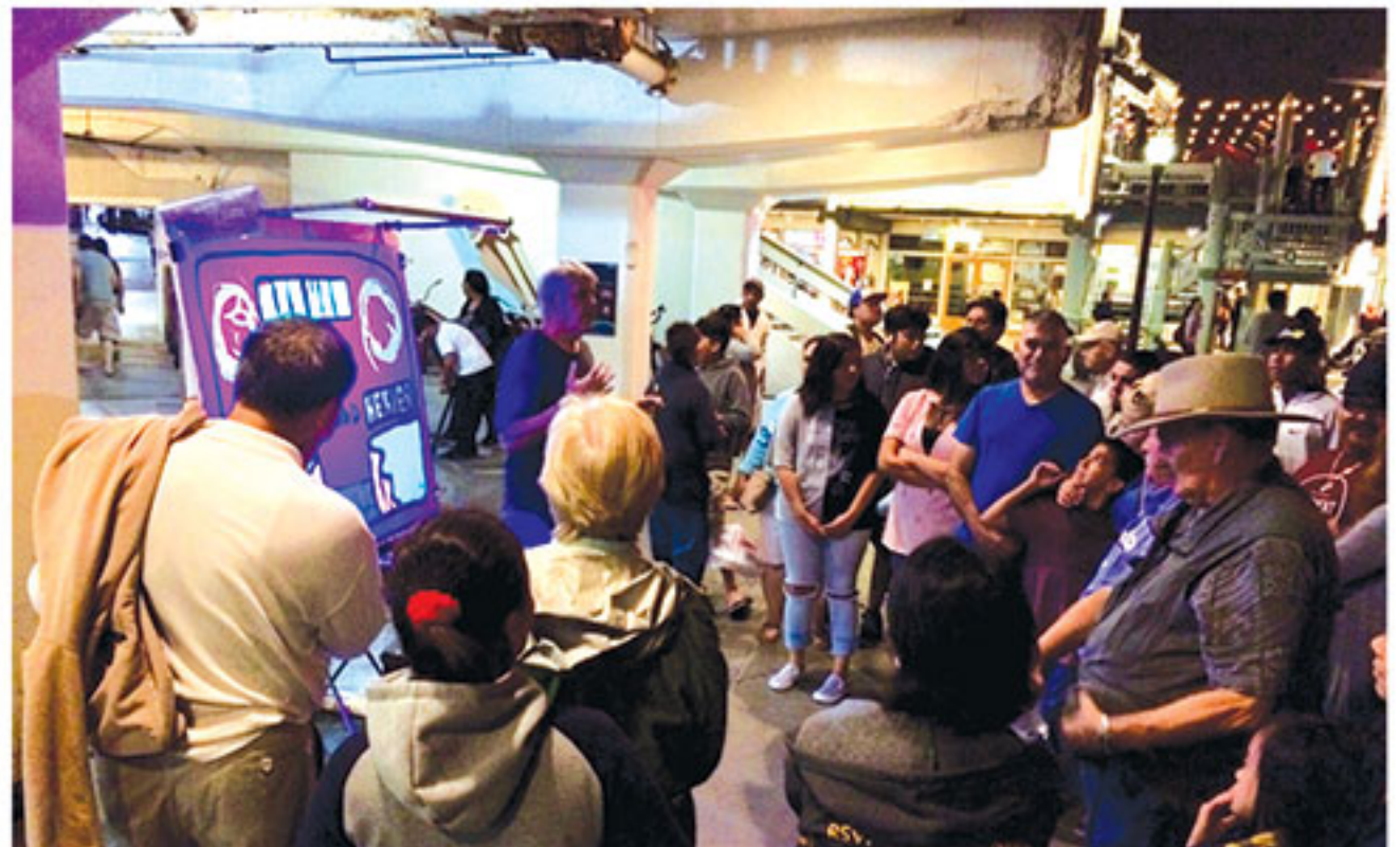
Preaching the gospel